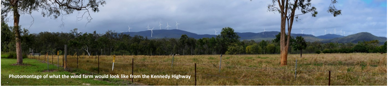
Photomontage of what the wind farm would look like from the Kennedy Highway