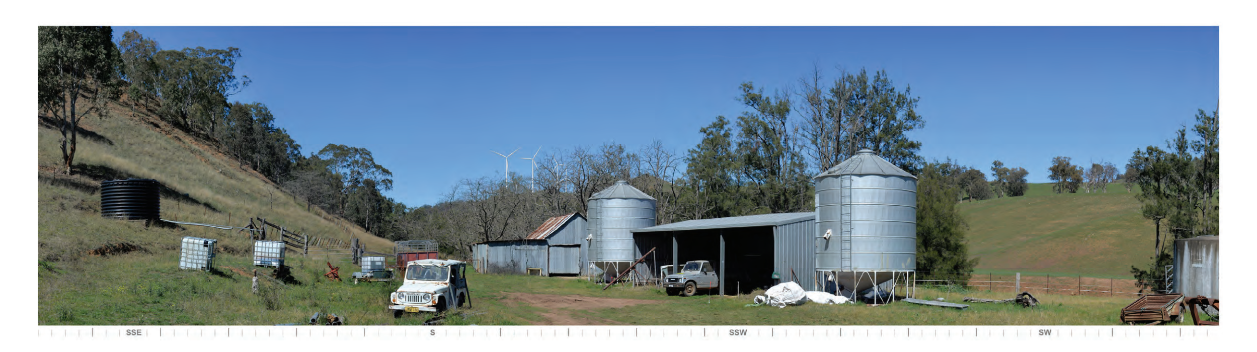
Figure 35 PM Dwelling T5-1

Closest visible wind turbine ID: 12 Bearing to closest visible turbine: 185* Distance to closest visible turbine (m): 2940 Projection: MGA Zone 56 (GDA 94) Photo Coordinates: E: 326359, N:6440007 Turbine dimensions: 150m hub, 220m tip