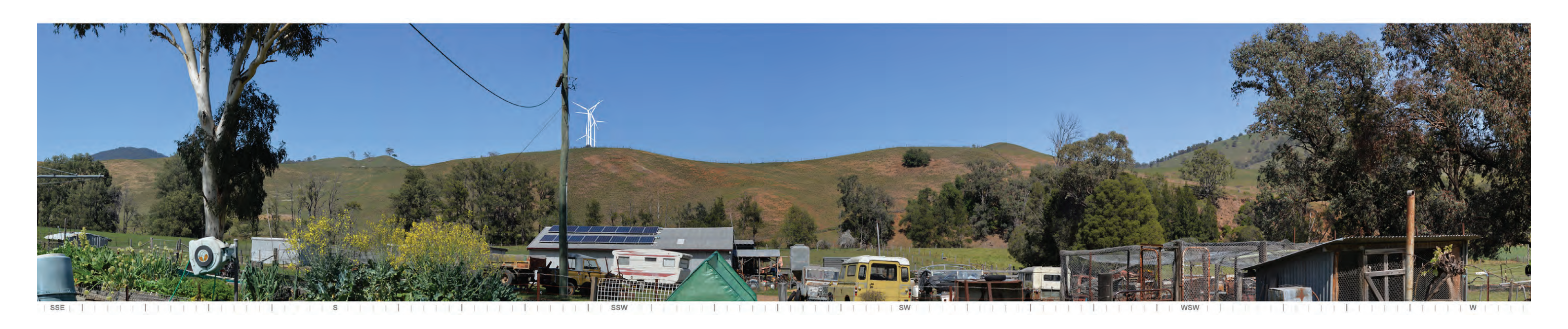
Figure 36 PM Dwelling T6-2

Closest visible wind turbine ID: 12 Bearing to closest visible turbine: 200° Distance to closest visible turbine (m): 2575 Projection: MGA Zone 56 (GDA 94) Photo Coordinates: 326973, 6439512 Turbine dimensions: 150m hub, 220m tip