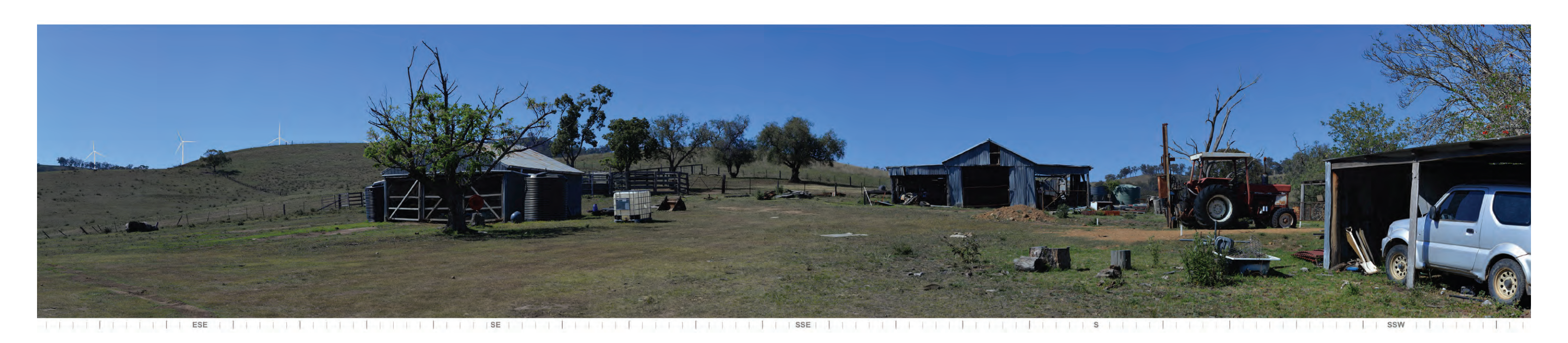
Figure 31 PM Dwelling P7-1

Closest visible wind turbine ID: 17 Bearing to closest visible turbine: 111* Distance to closest visible turbine (m): 3490 Projection: MGA Zone 56 (GDA 94) Photo Coordinates: E:322718, N:6437940 Turbine dimensions: 150m hub, 220m tip