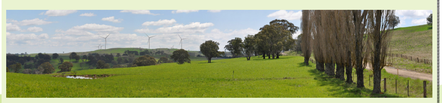
Looking North West from Maybole Road