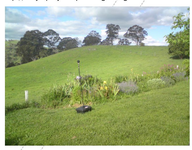
Noise loggers set up near associated residences, as per the Noise assessment requirements Epuron must undertake as part of the EA process.

The project applications and DGRs can be found on the NSW Department of Planning website at ... http://majorprojects.planning.nsw.gov.au