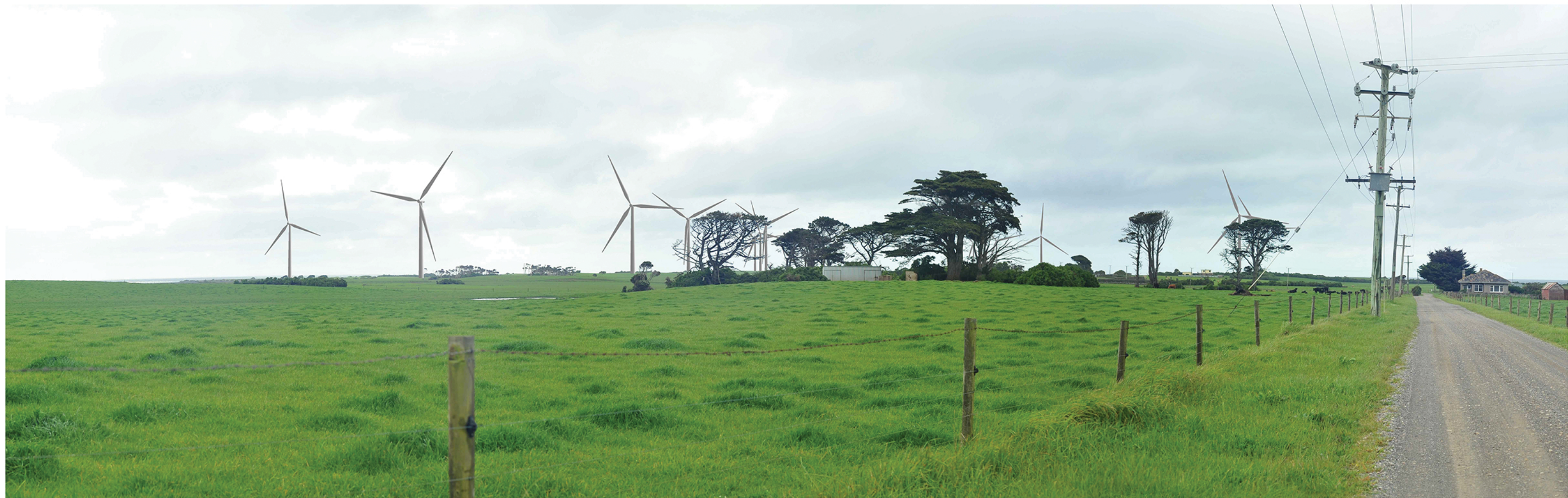
PM2 - Photomontage view from Green Hills Road (north of the Old Cable Station)

Approximate distance to closest visible wind turbine T1 is 1,355 metres