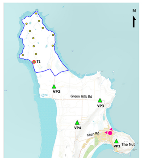
Photomontage location plan