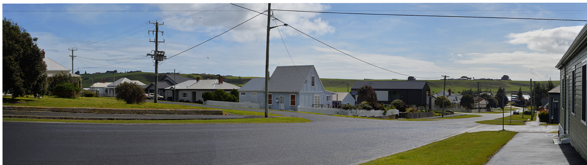
Existing panorama view from Church Street (Abbey's on Church)