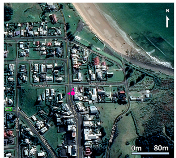
Aerial of photograph location