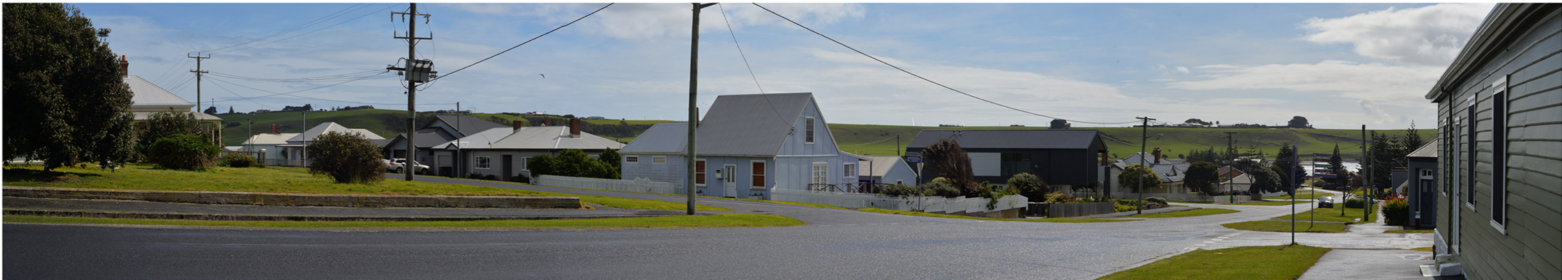
Photomontage view from Church Street (Abbey's on Church) Near the corner of Fletcher Street, Coordinates: Easting 356172, Northing 5486500