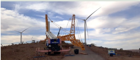
Silvertown NSW – 200MW Stage 1 In operation (AGL Energy /PARF)