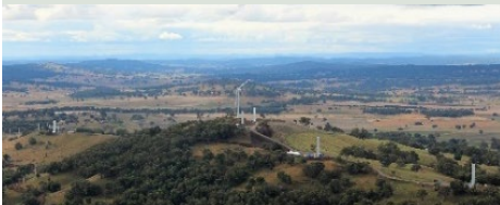
White Rock NSW – 175MW Stage 1 In operation. Stage 2 about to go to construction (CECEP/Goldwind)

For more information on Epuron's experience and projects please visit epuron.com.au