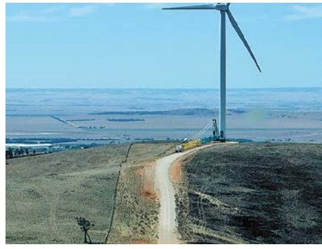
Access track providing a grass fire break.

The issue of fire safety is taken seriously with bushfire management plans being established at all wind farms and developed in consultation with the Rural Fire Service (RFS). The bushfire management plan would also establish procedures in the event of a fire moving through a wind farm. Drawing from examples around Australia, when fires have started on neighbouring properties and travelled towards a wind farm, the turbines have been stopped remotely and access to the site provided to local RFS to utilise the access tracks between turbines. Access tracks have also served as natural fire breaks for grass fires.