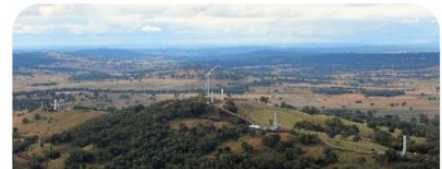
White Rock NSW – 175MW Stage 1 Construction Complete (Goldwind)