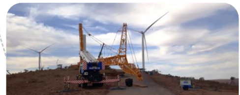
Silverton NSW – 200MW Stage 1 Construction Complete (AGL/PARF)