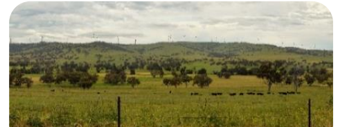
Liverpool Range NSW – < 267 turbines Approved - Sold to Tilt Renewables