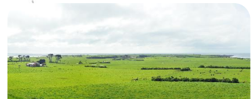
Western Plains TAS – < 13 turbines Planning Assessment