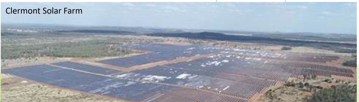
Clermont Solar Farm

Epuron's ~30 MW Walgett Solar Farm (NSW) is well poised in one of the sunniest locations in Australia. Walgett Solar Farm signed a Power Purchase Agreement with The University of Technology Sydney (UTS) in November which will supply up to half of the university's energy demand. The project is targeting to start construction of stage 1 in 2019.