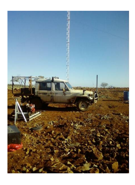
Wind monitoring mast installation