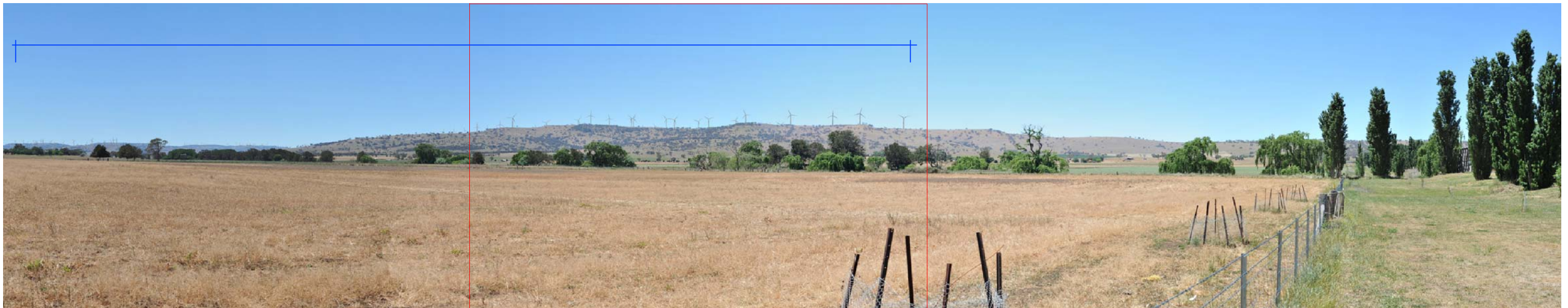
Public view location L10 Coolah - Proposed view through 120°. Approximate distance to closest visible wind turbine 5.9 km