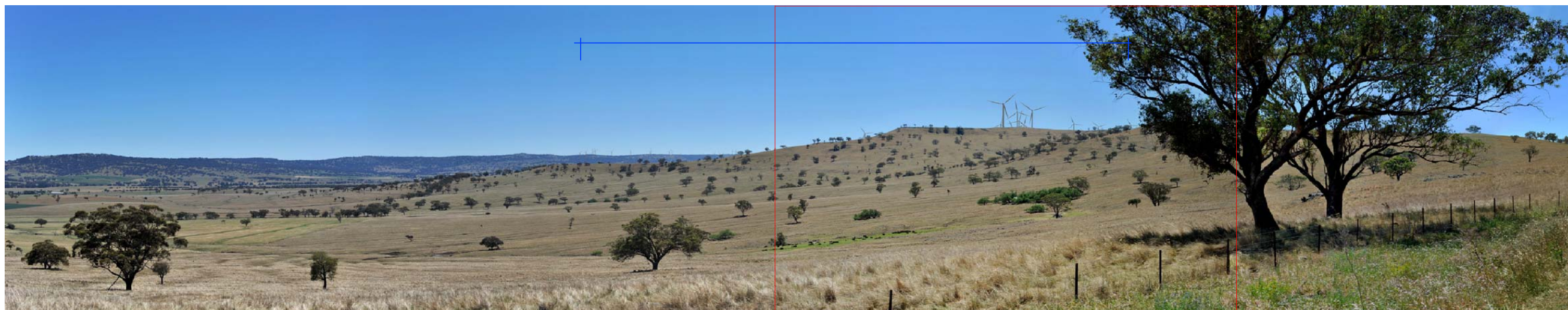
Public view location L9 Cassilis Road - Proposed view through 120°. Approximate distance to closest visible wind turbine 2.4 km