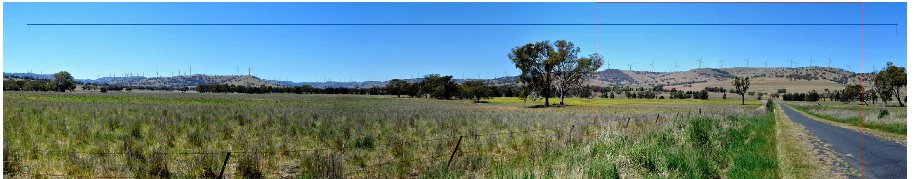
Public view location L11 Cooks Road - Proposed view through 120°. Approximate distance to closest visible wind turbine 4.3 km