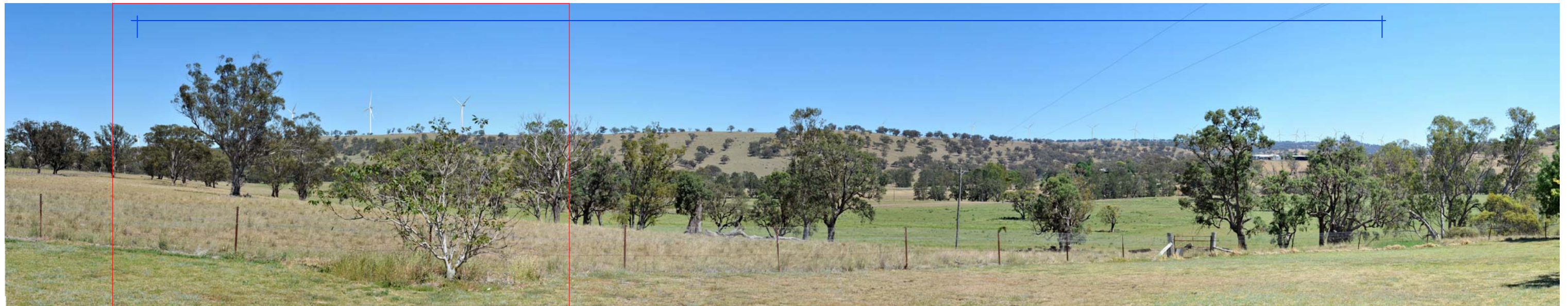
Public view location L7 Bill's block (uninvolved residential dwelling)- Proposed view through 120°. Approximate distance to closest visible wind turbine 2.1km