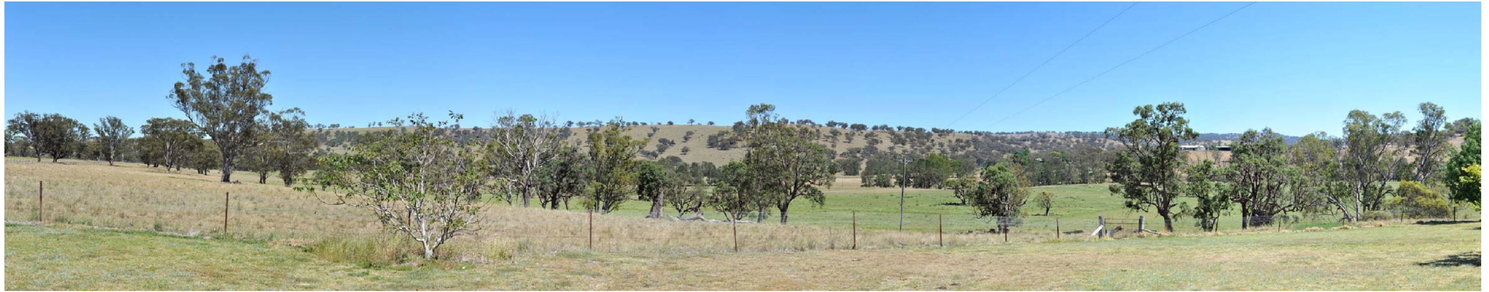
Public view location L7 Bill's block (uninvolved residential dwelling) - Existing view south west to north east. Photo coordinate Easting:779774 Northing:6466870 (MGAz55)