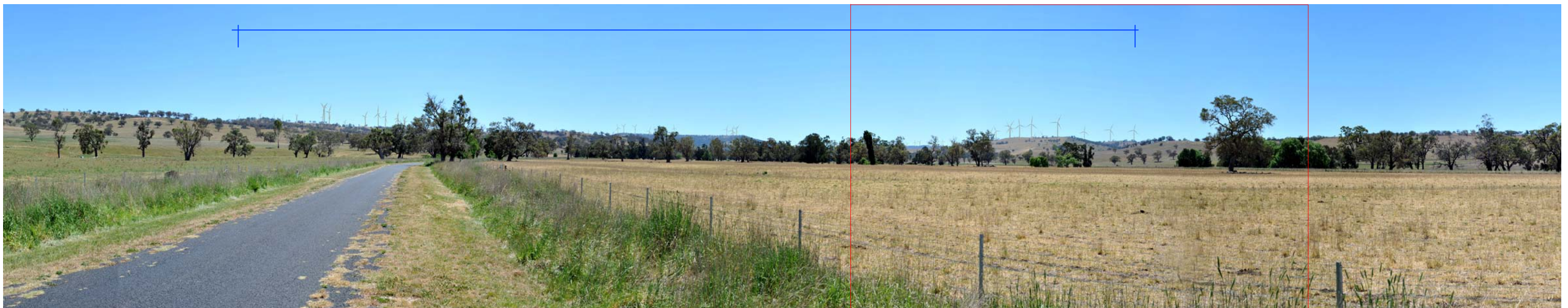
Public view location L8 Turee Vale Road - Proposed view through 120°. Approximate distance to closest visible wind turbine 3.8 km