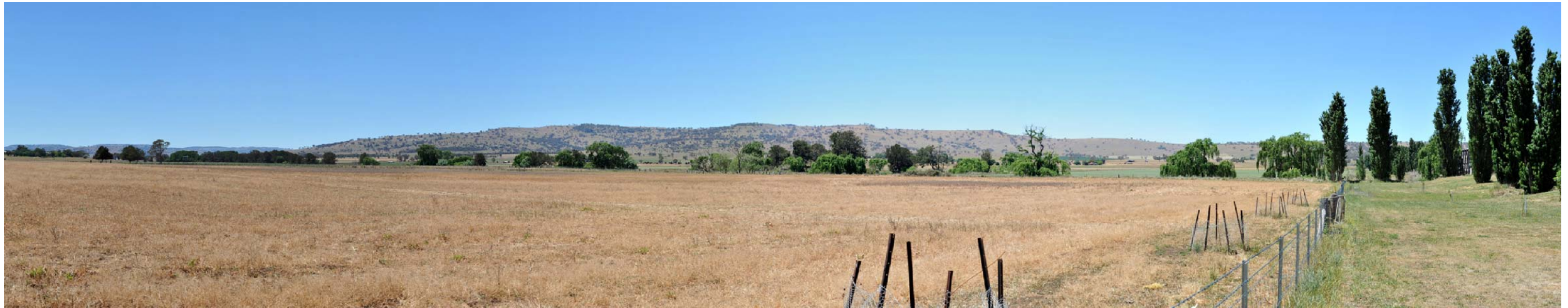
Public view location L10 Coolah - Existing view north north east to south east. Photo coordinate Easting:757844 Northing:6475675 (MGAz55)