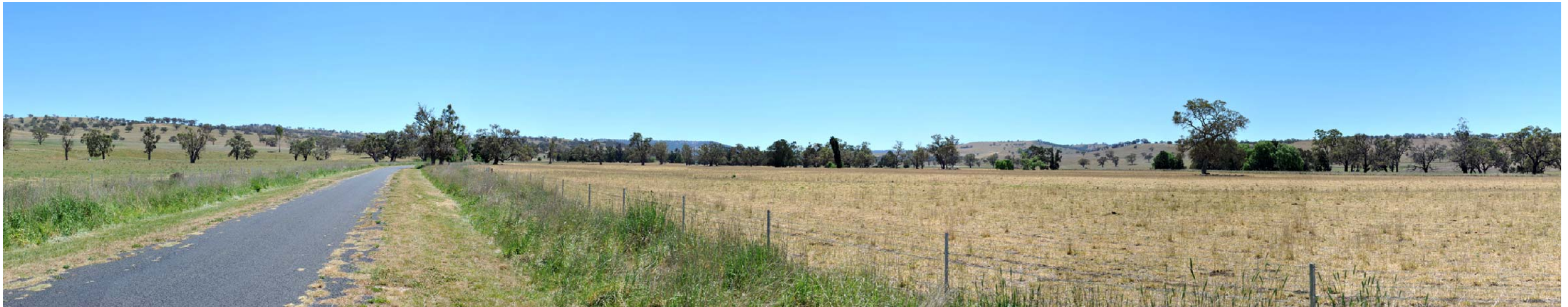
Public view location L8 Turee Vale Road - Existing view north north west to east. Photo coordinate Easting:767449 Northing:6466870 (MGaz55)