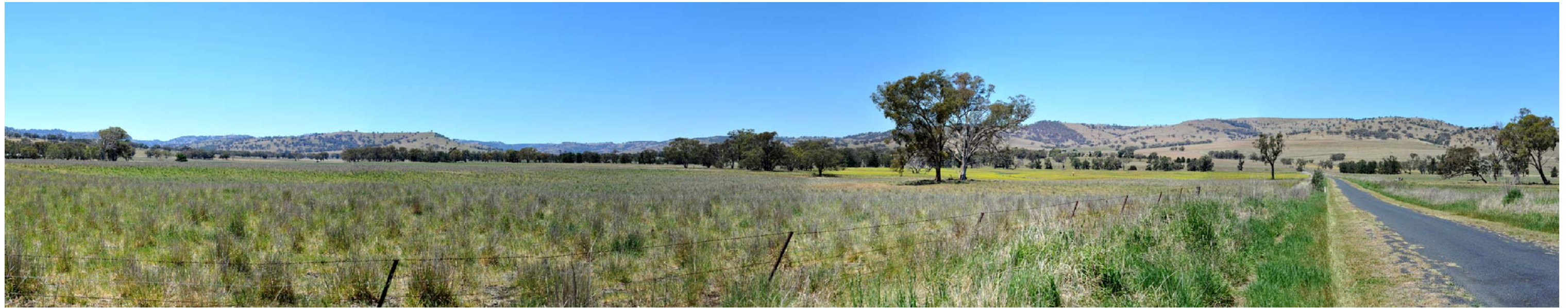
Public view location L11 Cooks Road - Existing view north north east to south east. Photo coordinate Easting:762361 Northing:6480829 (MGAz55)