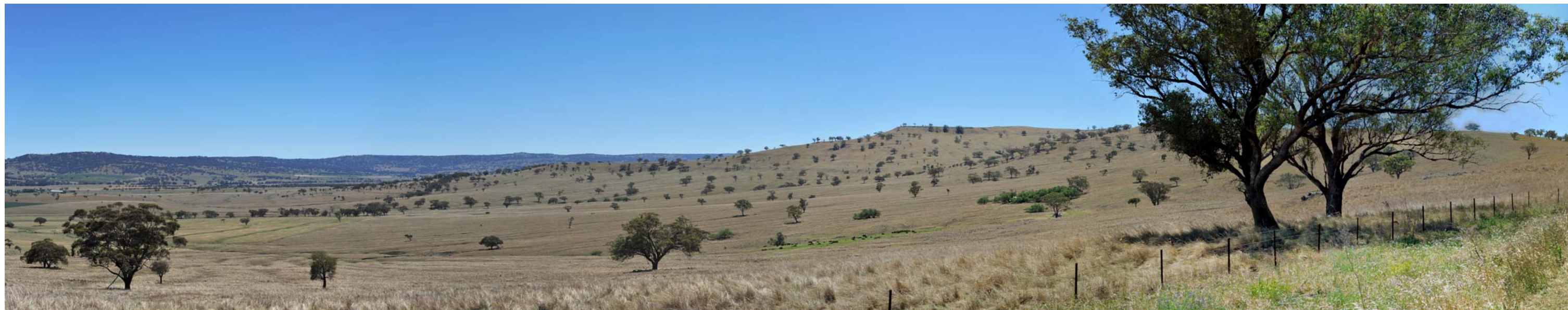
Public view location L9 Cassilis Road - Existing view north north west to east. Photo coordinate Easting:762098 Northing:6472045 (MGAz55)