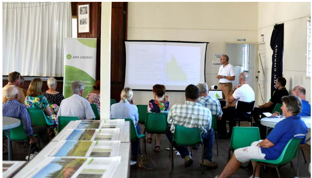
A community consultation session in Marlborough. Consultation through the information centre in Rockhampton, local public sessions, meetings with local stakeholder groups and participation in local community events has been underway since 2022 and is ongoing.