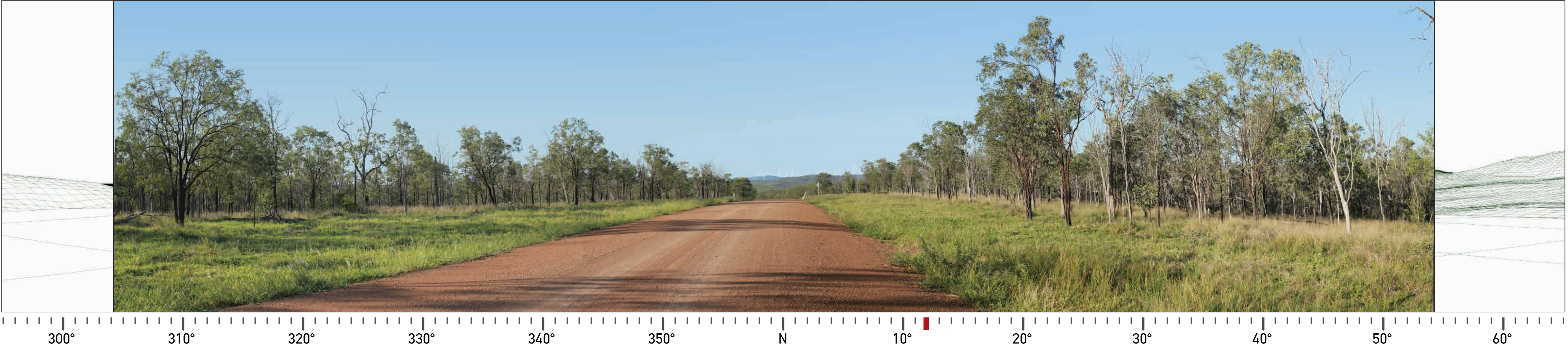
130° Photomontage view facing North from Apis Creek Rd - Viewpoint 7 (Wind Turbine Dimensions: 164m hub height, 175m rotor diameter - 251.5m tip height)