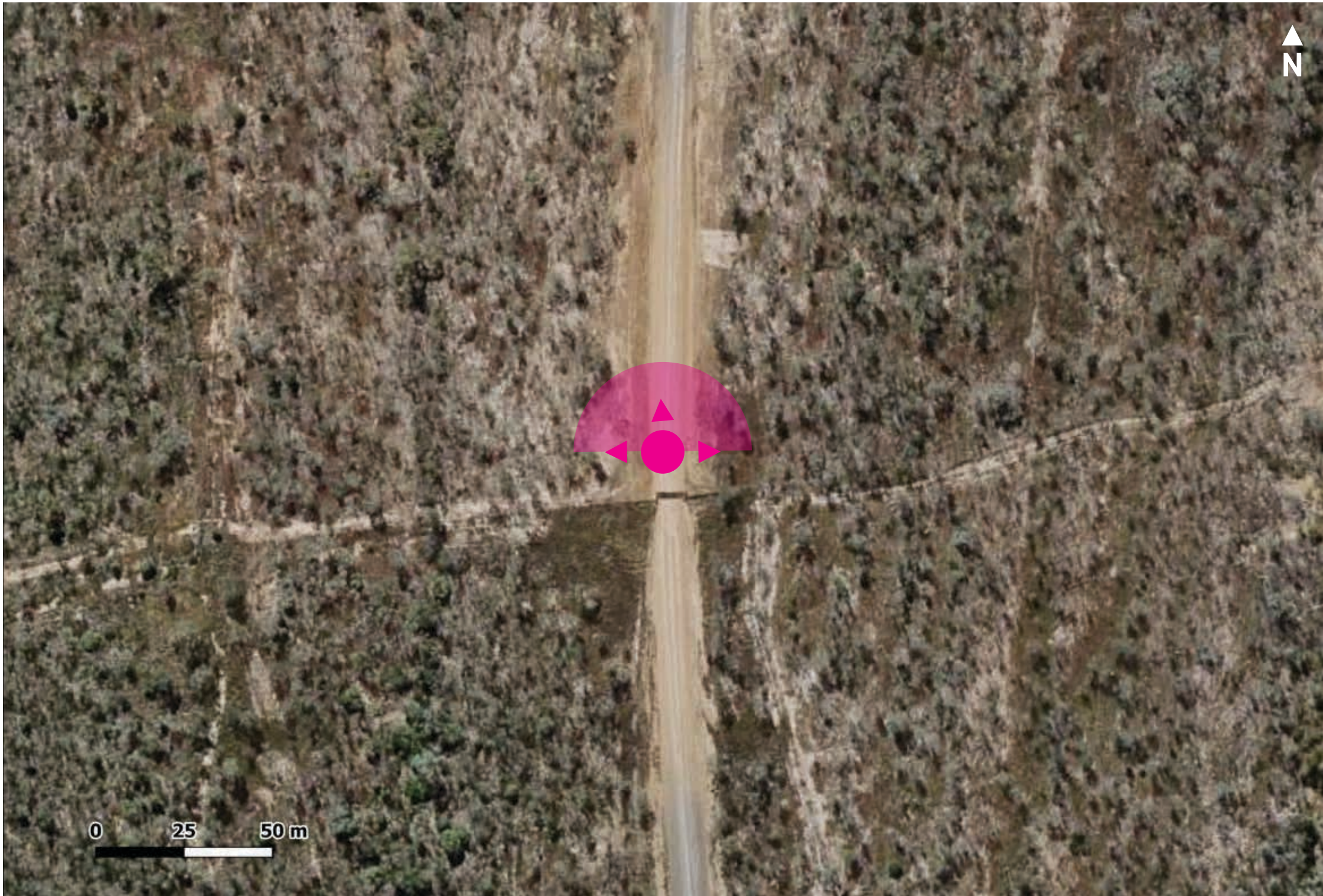
Aerial: viewpoint location and photograph direction shown by the pink marker.