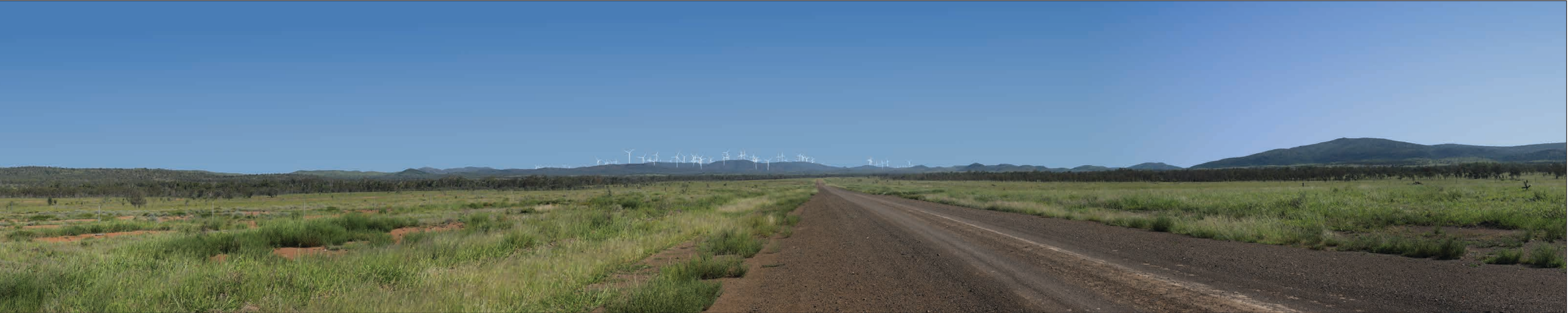
130° Photomontage view facing South from Apis Creek Rd - Viewpoint 4 (Wind Turbine Dimensions: 164m hub height, 175m rotor diameter - 251.5m tip height)