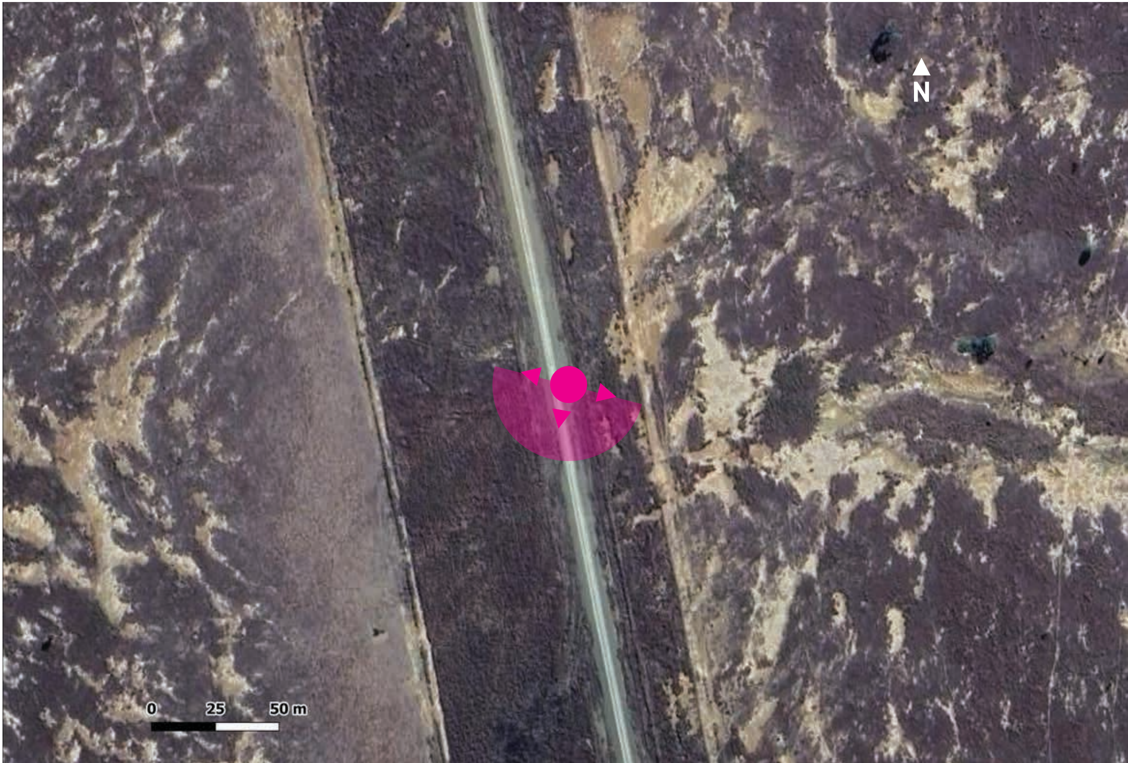
Aerial: viewpoint location and photograph direction shown by the pink marker.