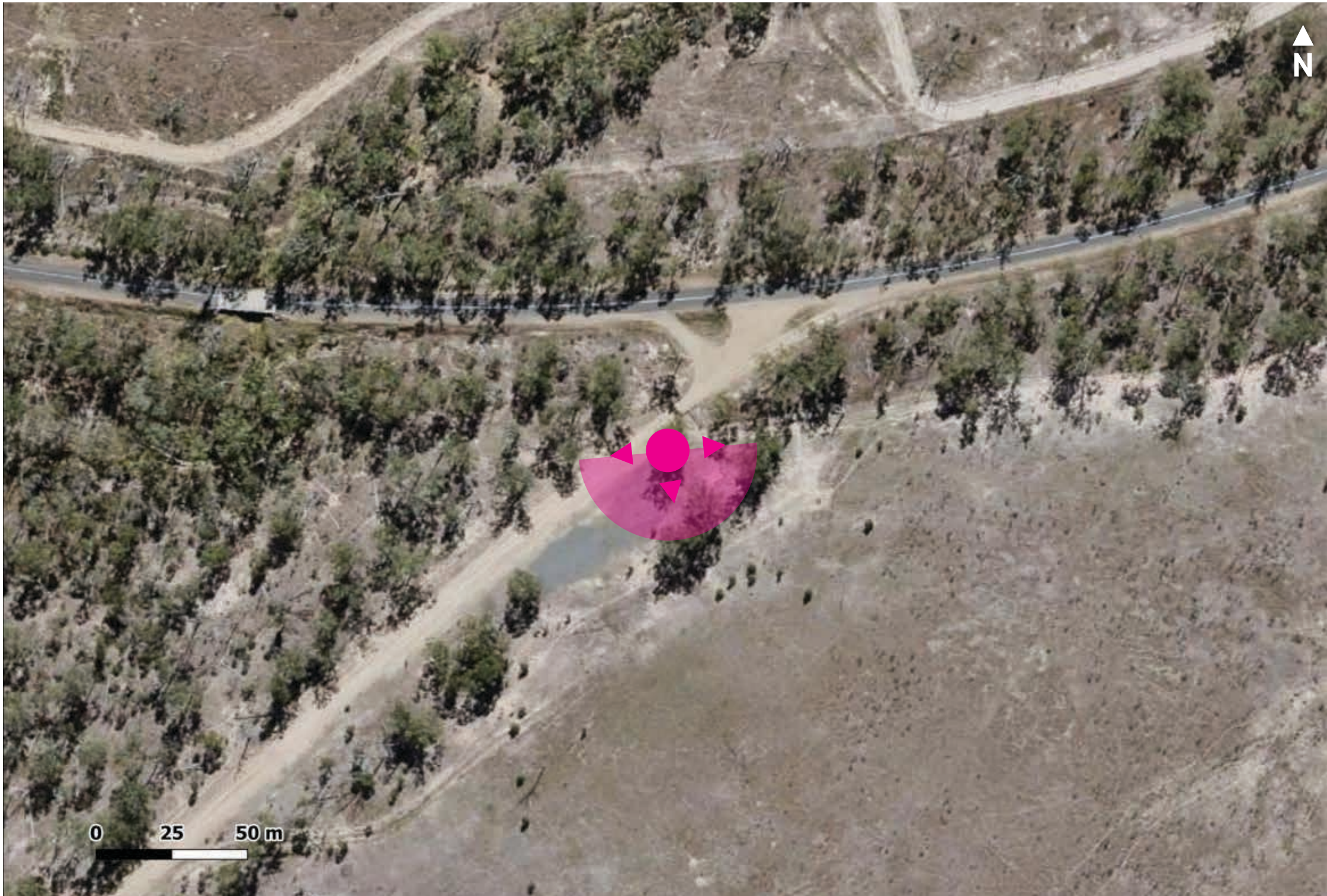
Aerial: viewpoint location and photograph direction shown by the pink marker.