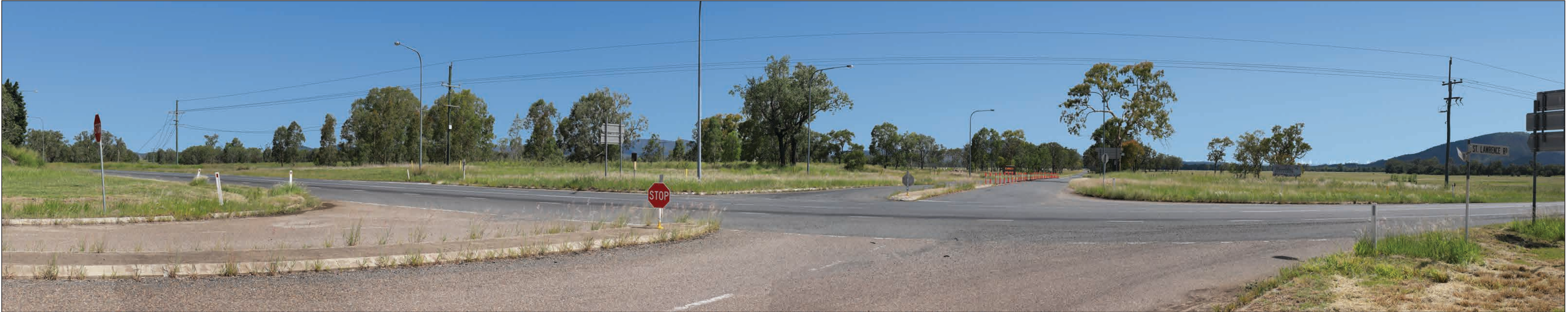
130° Photomontage view facing South from Glenprairie Bypass Rd - Bruce Hwy Intersection - Viewpoint 2 (Wind Turbine Dimensions: 164m hub height, 175m rotor diameter - 251.5m tip height)