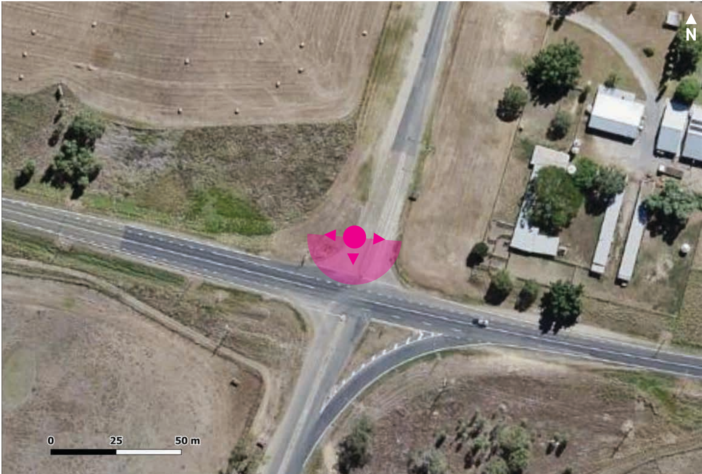
Aerial: viewpoint location and photograph direction shown by the pink marker.