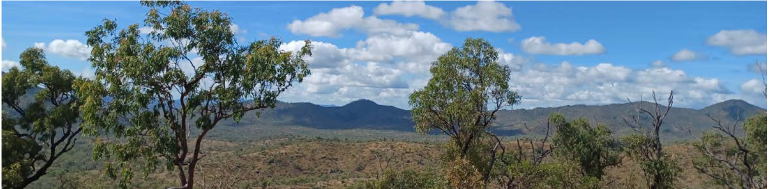
Photograph of the project area