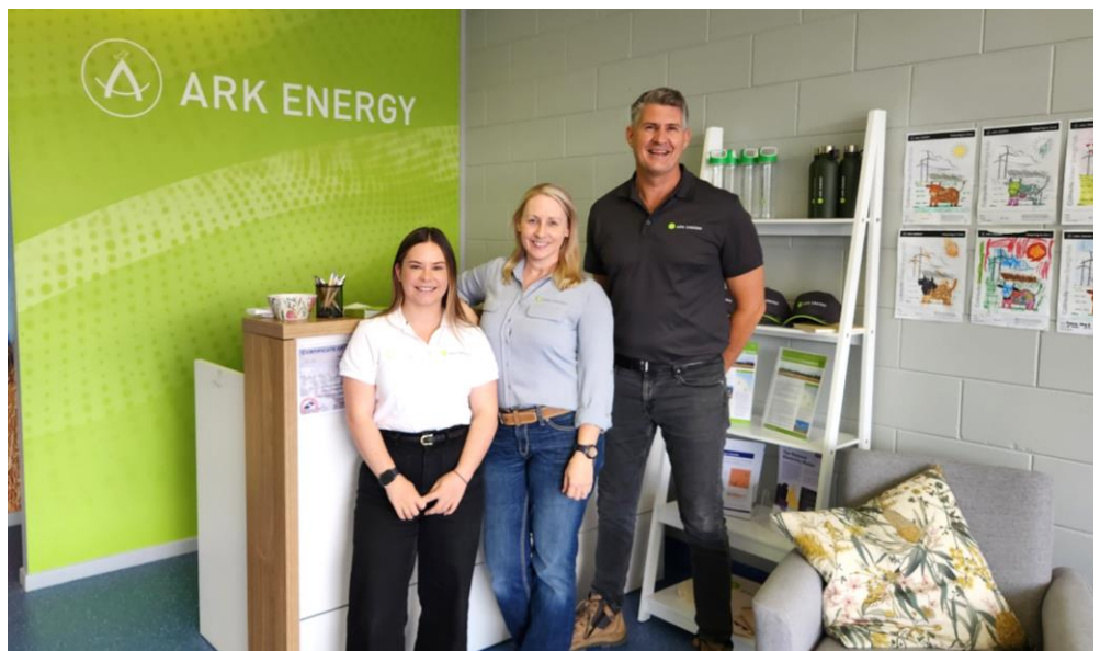
The Collinsville Green Energy Hub Office & Information Centre provides access to up-to-date project information and the opportunity to discuss the proposal with the project team.