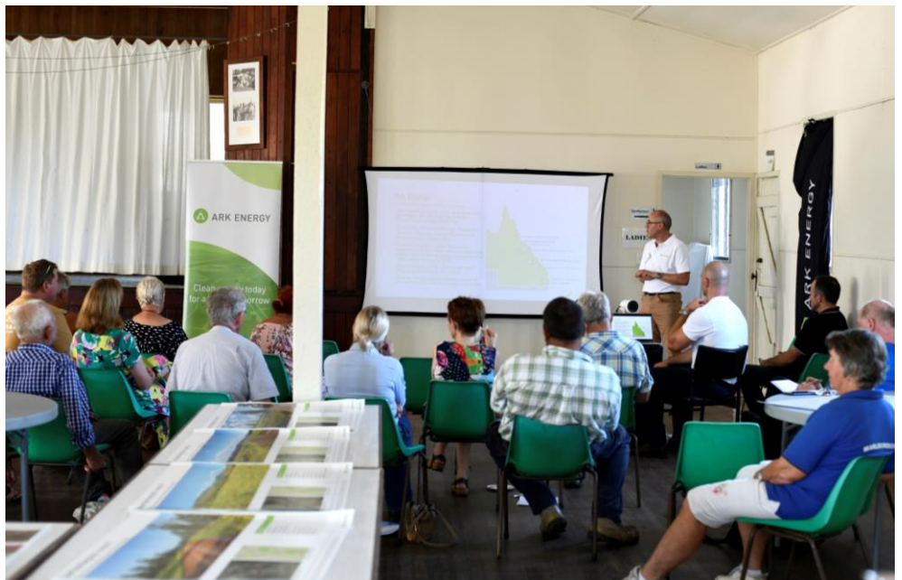
Boomer Green Energy Hub information session at Marlborough Community Hall