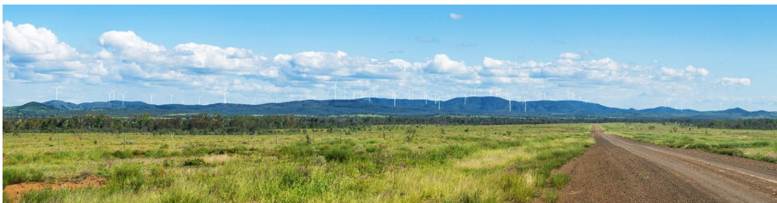
A photomontage showing what the wind farm might look like from Apis Creek Road, Mount Gardiner.