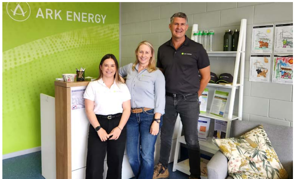
The Collinsville Green Energy Hub Office & Information Centre provides access to up-to-date project information and maps, and the opportunity to discuss the proposal with a member of the project team. The centre is at 47 Railway Road in Collinsville.