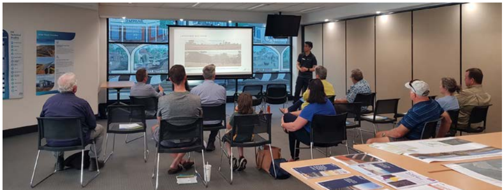
Local community information sessions for the Richmond Valley Solar Farm.