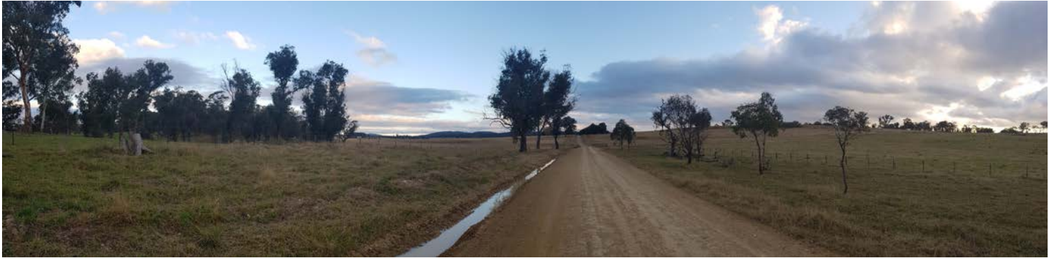
Photograph taken on Dyamberin Rd, looking south towards the Doughboy Wind Farm project area, approximately 4 km away.