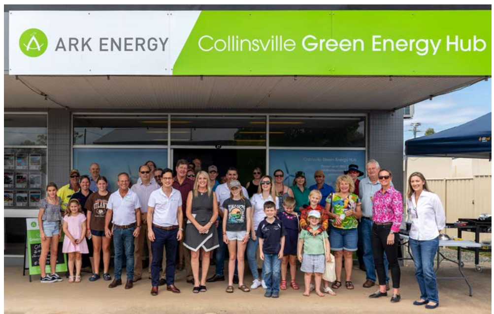
Official opening of the Collinsville Green Energy Hub Information Centre in November 2022.