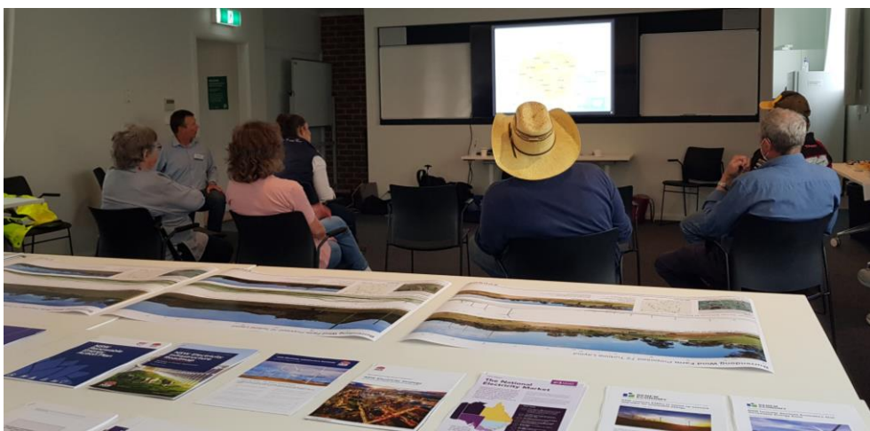
Community information sessions