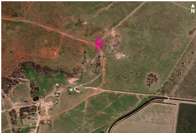
Aerial: viewpoint location and direction shown as a pink marker.