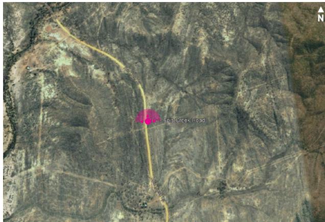
Aerial: viewpoint location and direction shown as a pink marker.