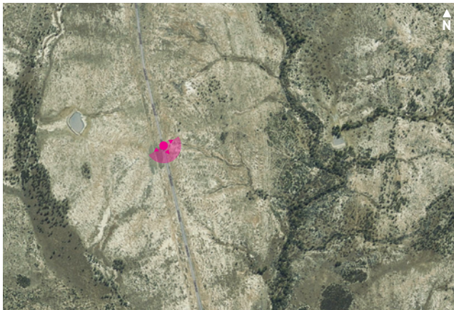
Aerial: viewpoint location and direction shown as a pink marker.