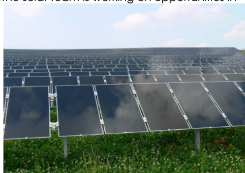
Photovoltaic Modules (PV)

In other exciting news, Epuron is increasing its explorations of utility-scale solar energy options. The solar team is working on opportunities in