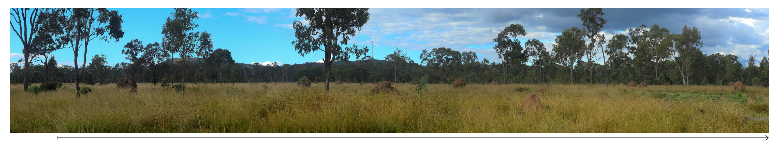
Approximate extent of proposed turbine locations