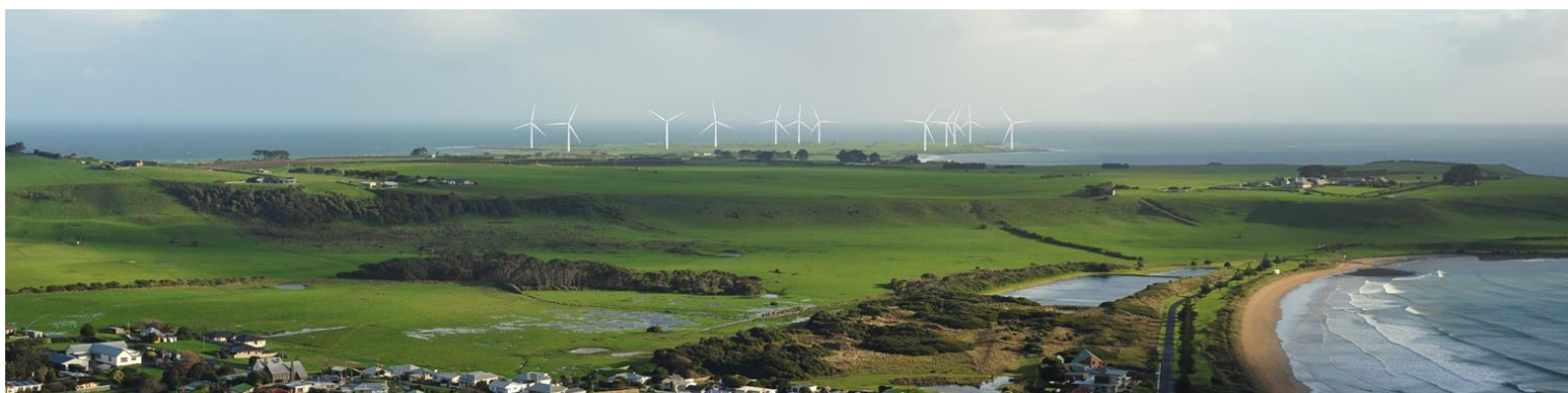
Photomontage showing what Western Plains Wind Farm would look like from The Nut.