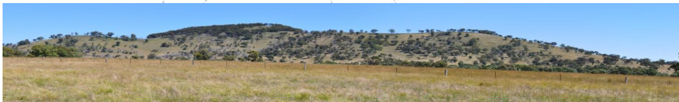
View of the proposed wind farm site from Carrot Farm Road

The department prepared and exhibited the Draft NSW Wind Farm Planning Guidelines in December 2011. Once these guidelines have been finalised they will be used to guide investment in wind farms across NSW with the aim of minimising the potential negative impacts of wind farms on local communities.