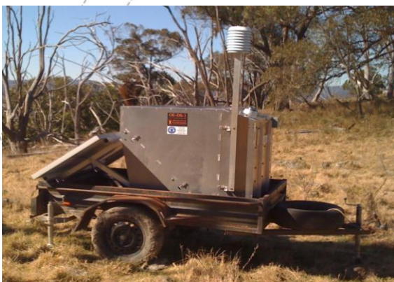
A Fulcrum 3D Sodar used for measuring wind speed